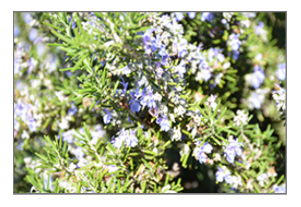
Blue Spires Rosemary flowers

This is a dense multi-stemmed evergreen woody herb with an upright spreading habit of growth. Its relatively fine texture sets it apart from other landscape plants with less refined foliage. This plant will require occasional maintenance and upkeep, and is best cleaned up in early spring before it resumes active growth for the season. Deer don't particularly care for this plant and will usually leave it alone in favor of tastier treats. It has no significant negative characteristics.