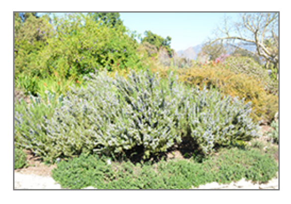
Blue Spires Rosemary in bloom