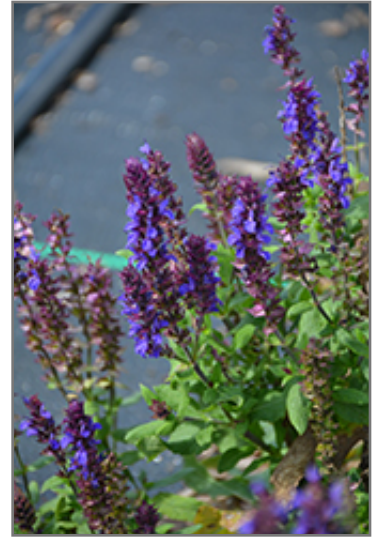
New Dimension Blue Sage flowers

New Dimension Blue Sage is recommended for the following landscape applications;