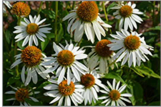
Happy Star Coneflower flowers

Happy Star Coneflower is recommended for the following landscape applications;