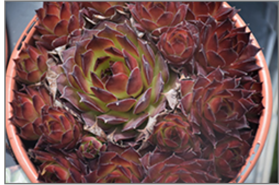
Black Hens And Chicks

Black Hens And Chicks is a fine choice for the garden, but it is also a good selection for planting in outdoor pots and containers. It is often used as a 'filler' in the 'spiller-thriller-filler' container combination, providing a canvas of foliage against which the larger thriller plants stand out. Note that when growing plants in outdoor containers and baskets, they may require more frequent waterings than they would in the yard or garden.