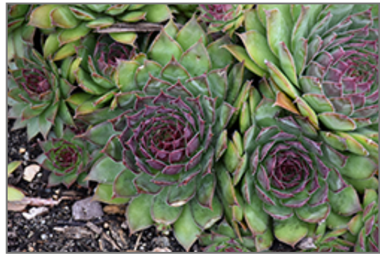
Black Hens And Chicks

Thank you for choosing Seoane's Garden Center