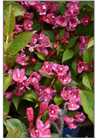
Date Night Strobe Weigela flowers

Thank you for choosing Seoane's Garden Center