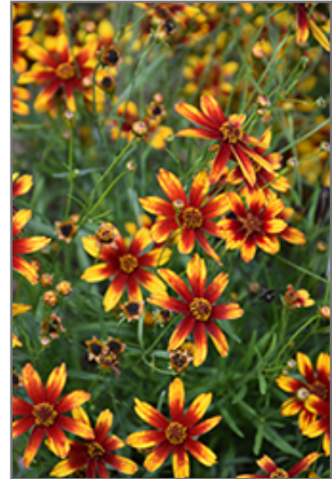
Satin & Lace Red Tapestry Tickseed flowers

Satin & Lace Red Tapestry Tickseed is recommended for the following landscape applications;