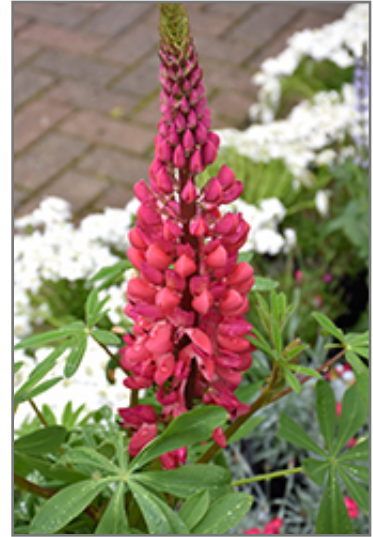
Westcountry Red Rum Lupine flowers

Thank you for choosing Seoane's Garden Center