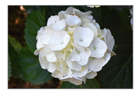
Seaside Serenade Cape Lookout Hydrangea flowers