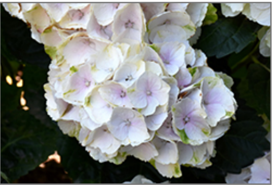
Seaside Serenade Cape Lookout Hydrangea flowers

This shrub does best in full sun to partial shade. You may want to keep it away from hot, dry locations that receive direct afternoon sun or which get reflected sunlight, such as against the south side of a white wall. It requires an evenly moist well-drained soil for optimal growth. It is not particular as to soil type, but has a definite preference for acidic soils. It is highly tolerant of urban pollution and will even thrive in inner city environments, and will benefit from being planted in a relatively sheltered location. Consider applying a thick mulch around the root zone in both summer and winter to conserve soil moisture and protect it in exposed locations or colder microclimates. This is a selected variety of a species not originally from North America.