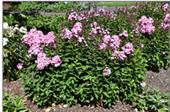
Volcano Pink with White Eye Garden Phlox in bloom

Thank you for choosing Seoane's Garden Center