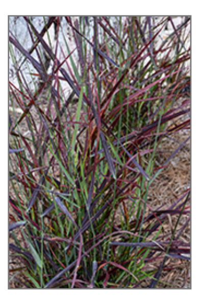
Hot Rod Switch Grass foliage