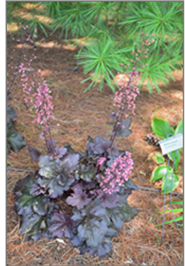
Primo Mahogany Monster Coral Bells in bloom

Primo Mahogany Monster Coral Bells is a fine choice for the garden, but it is also a good selection for planting in outdoor pots and containers. With its upright habit of growth, it is best suited for use as a 'thriller' in the 'spiller-thriller-filler' container combination; plant it near the center of the pot, surrounded by smaller plants and those that spill over the edges. Note that when growing plants in outdoor containers and baskets, they may require more frequent waterings than they would in the yard or garden.