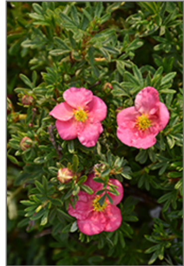
Bella Bellissima Potentilla flowers