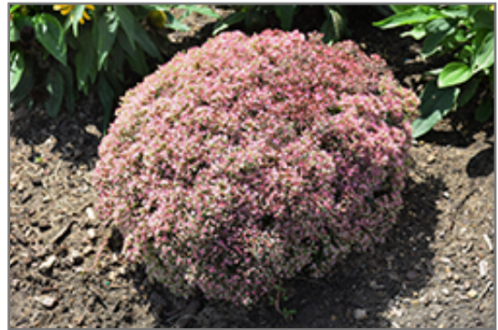
Rock 'N Round Pride and Joy Stonecrop in bloom

Thank you for choosing Seoane's Garden Center