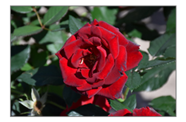
Dancing In The Dark Rose flowers