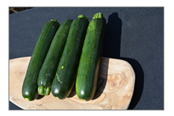
Zucchini (Generic) fruit

551 Bedford St Abington, MA 02351 | 781-878-1306 | garden@seoanelandscape.com