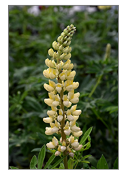
Chandelier Lupine flowers

551 Bedford St Abington, MA 02351 | 781-878-1306 | garden@seoanelandscape.com