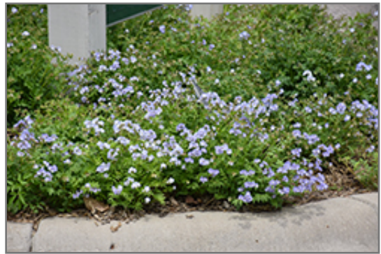
Creeping Jacob's Ladder in bloom

Thank you for choosing Seoane's Garden Center