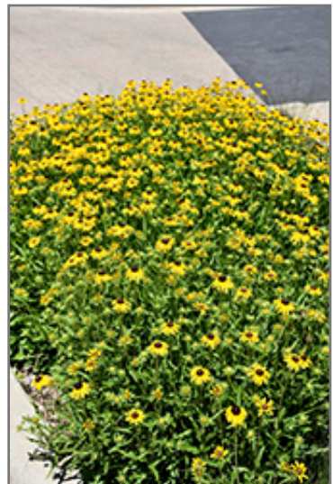
Viette's Little Suzy Coneflower in bloom