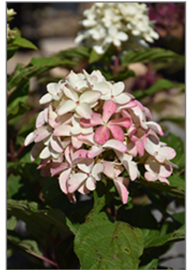
Quick Fire Fab Hydrangea flowers

Thank you for choosing Seoane's Garden Center