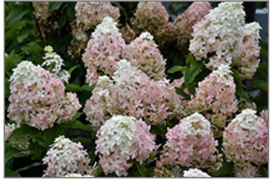
Quick Fire Fab Hydrangea flowers