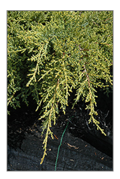
Gold Star Juniper foliage