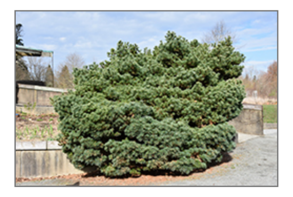
Blue Shag White Pine