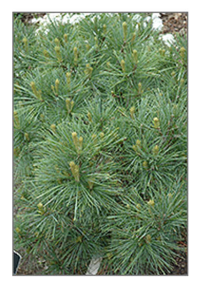
Blue Shag White Pine foliage