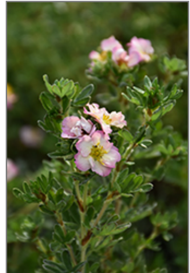
Happy Face Hearts Potentilla flowers

Thank you for choosing Seoane's Garden Center