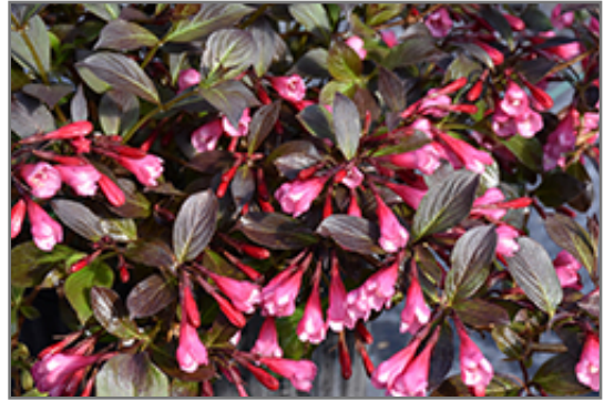
Very Fine Wine Weigela flowers