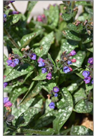
Spot On Lungwort flowers

Spot On Lungwort is recommended for the following landscape applications;