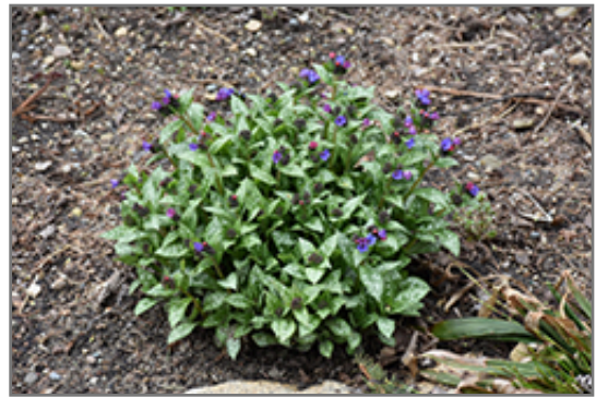
Spot On Lungwort in bloom

Thank you for choosing Seoane's Garden Center