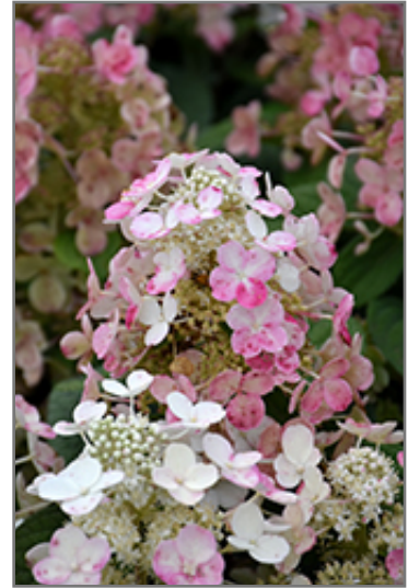
Torch Hydrangea flowers

Torch Hydrangea will grow to be about 5 feet tall at maturity, with a spread of 5 feet. It tends to fill out right to the ground and therefore doesn't necessarily require facer plants in front, and is suitable for planting under power lines. It grows at a medium rate, and under ideal conditions can be expected to live for 40 years or more.