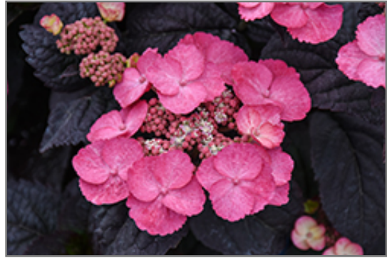
Pink Dynamo Hydrangea flowers Photo courtesy of NetPS Plant Finder

Pink Dynamo Hydrangea is recommended for the following landscape applications;