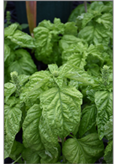
Italian Large Leaf Sweet Basil foliage

Italian Large Leaf Sweet Basil will grow to be about 30 inches tall at maturity, with a spread of 24 inches. When grown in masses or used as a bedding plant, individual plants should be spaced approximately 12 inches apart. Although it's not a true annual, this fast-growing plant can be expected to behave as an annual in our climate if left outdoors over the winter, usually needing replacement the following year. As such, gardeners should take into consideration that it will perform differently than it would in its native habitat.