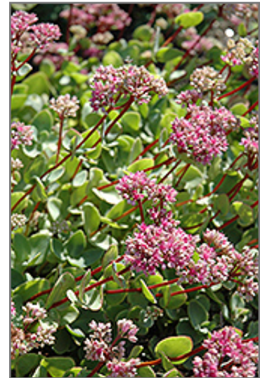
October Daphne flowers

Thank you for choosing Seoane's Garden Center