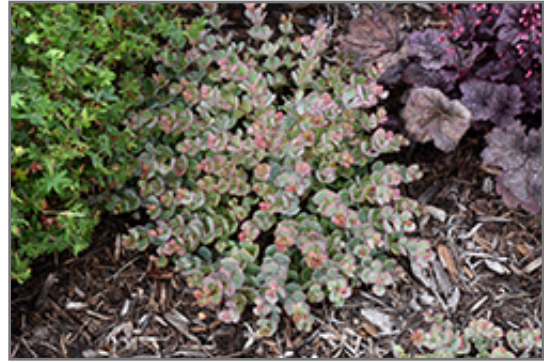
October Daphne