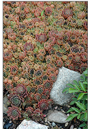
Silverine Hens And Chicks

Thank you for choosing Seoane's Garden Center