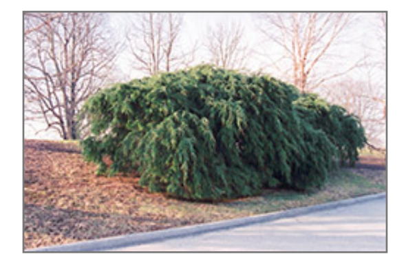
Sargent's Weeping Hemlock