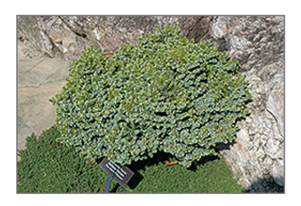
Pimoko Spruce