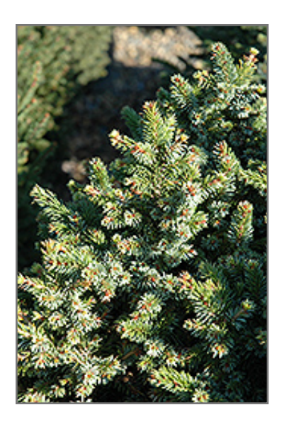
Pimoko Spruce foliage