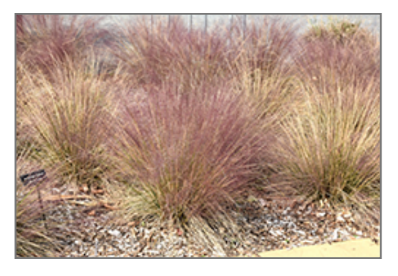
Hairawn Muhly in fall