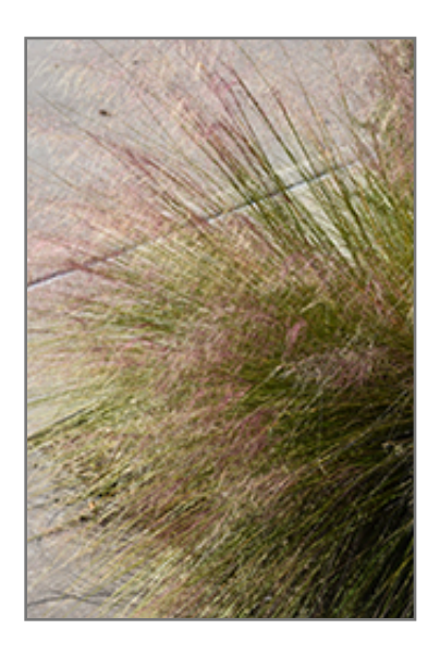
Hairawn Muhly flowers

This plant should only be grown in full sunlight. It prefers dry to average moisture levels with very well-drained soil, and will often die in standing water. It is considered to be drought-tolerant, and thus makes an ideal choice for a low-water garden or xeriscape application. It is particular about its soil conditions, with a strong preference for poor, acidic soils. It is somewhat tolerant of urban pollution. This species is native to parts of North America. It can be propagated by division.