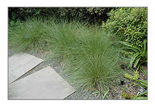
Hairawn Muhly

Hairawn Muhly is recommended for the following landscape applications;