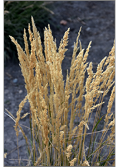
El Dorado Feather Reed Grass fruit

El Dorado Feather Reed Grass is a fine choice for the garden, but it is also a good selection for planting in outdoor pots and containers. Because of its height, it is often used as a 'thriller' in the 'spiller-thriller-filler' container combination; plant it near the center of the pot, surrounded by smaller plants and those that spill over the edges. It is even sizeable enough that it can be grown alone in a suitable container. Note that when growing plants in outdoor containers and baskets, they may require more frequent waterings than they would in the yard or garden.