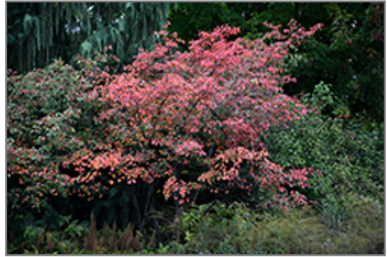
Autumn Brilliance Serviceberry in fall

This tree does best in full sun to partial shade. It prefers to grow in average to moist conditions, and shouldn't be allowed to dry out. It is not particular as to soil type or pH. It is somewhat tolerant of urban pollution. This particular variety is an interspecific hybrid.