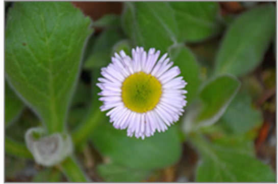
Lynnhaven Carpet Fleabane flowers

Lynnhaven Carpet Fleabane will grow to be about 7 inches tall at maturity extending to 15 inches tall with the flowers, with a spread of 15 inches. Its foliage tends to remain low and dense right to the ground. The flower stalks can be weak and so it may require staking in exposed sites or excessively rich soils. It grows at a fast rate, and under ideal conditions can be expected to live for approximately 10 years. As an herbaceous perennial, this plant will usually die back to the crown each winter, and will regrow from the base each spring. Be careful not to disturb the crown in late winter when it may not be readily seen!