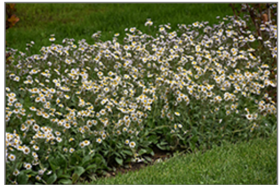
Lynnhaven Carpet Fleabane in bloom

Thank you for choosing Seoane's Garden Center