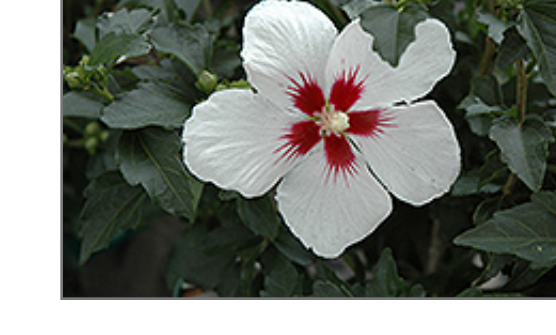
Lil' Kim Rose of Sharon flowers

Lil' Kim Rose of Sharon is recommended for the following landscape applications;