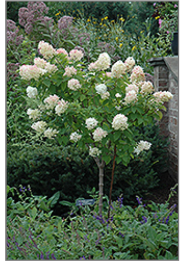
Limelight Hydrangea (tree form) in bloom

Limelight Hydrangea (tree form) will grow to be about 6 feet tall at maturity, with a spread of 7 feet. It tends to be a little leggy, with a typical clearance of 3 feet from the ground, and is suitable for planting under power lines. It grows at a medium rate, and under ideal conditions can be expected to live for 40 years or more.