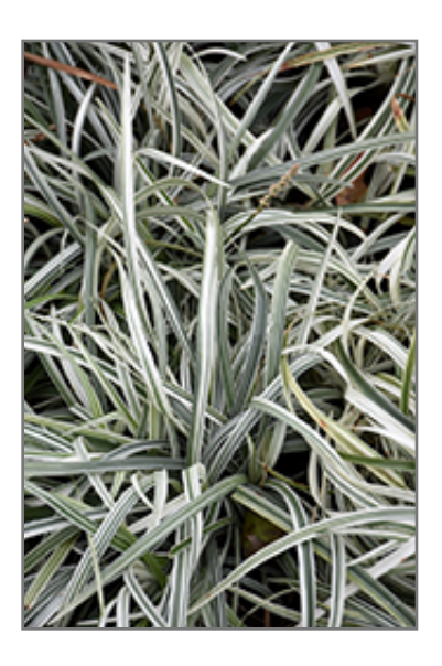
Silver Dragon Lily Turf