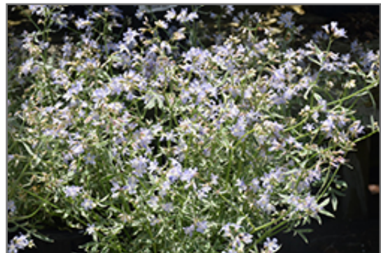
Touch Of Class Jacob's Ladder flowers

Thank you for choosing Seoane's Garden Center