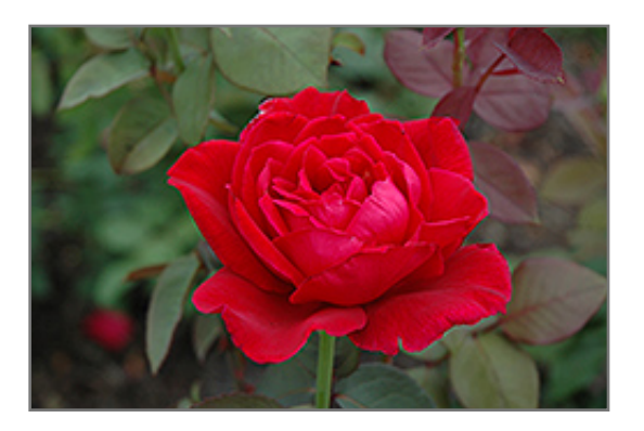
Mister Lincoln Rose flowers

Mister Lincoln Rose is recommended for the following landscape applications;