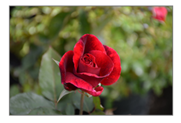
Mister Lincoln Rose flower buds