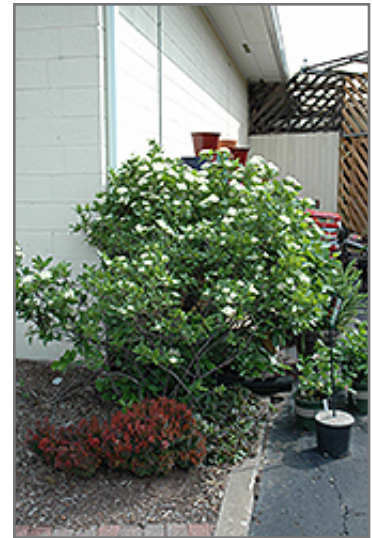
Winterthur Viburnum in bloom

Thank you for choosing Seoane's Garden Center