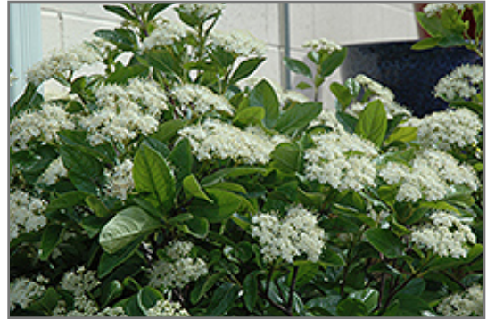
Winterthur Viburnum flowers

This is a relatively low maintenance shrub, and should only be pruned after flowering to avoid removing any of the current season's flowers. It is a good choice for attracting birds to your yard, but is not particularly attractive to deer who tend to leave it alone in favor of tastier treats. It has no significant negative characteristics.