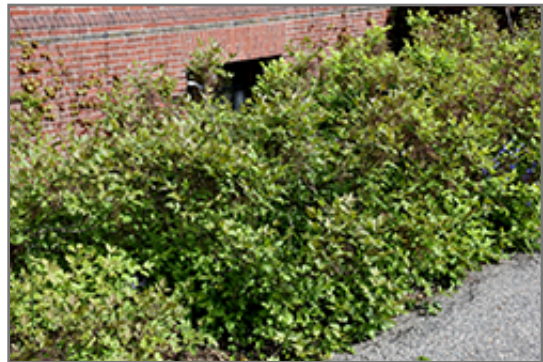
Shrub Yellowroot

Thank you for choosing Seoane's Garden Center