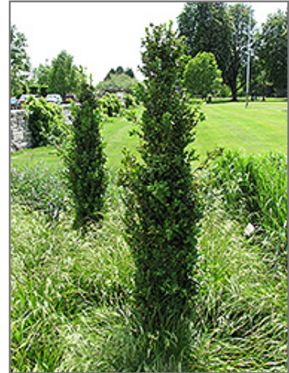
Graham Blandy Boxwood