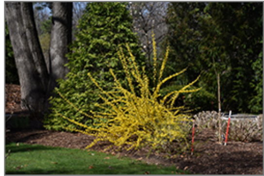
Show Off Forsythia in bloom

Thank you for choosing Seoane's Garden Center