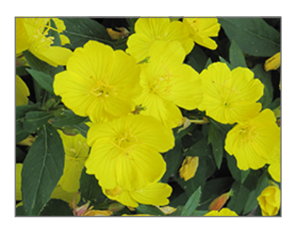
Fireworks Sundrops flowers