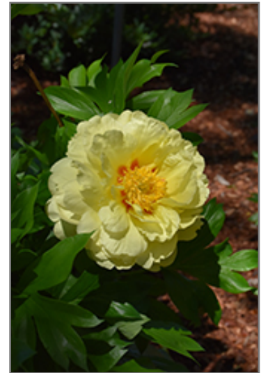
Bartzella Peony flowers

Thank you for choosing Seoane's Garden Center