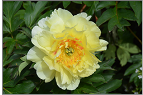
Bartzella Peony flowers

Bartzella Peony is recommended for the following landscape applications;