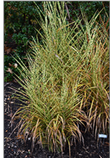
Gold Breeze Maiden Grass

Thank you for choosing Seoane's Garden Center