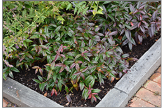
Scarletta Fetterbush

This shrub does best in partial shade to shade. It does best in average to evenly moist conditions, but will not tolerate standing water. It is not particular as to soil type, but has a definite preference for acidic soils. It is somewhat tolerant of urban pollution. This is a selection of a native North American species.