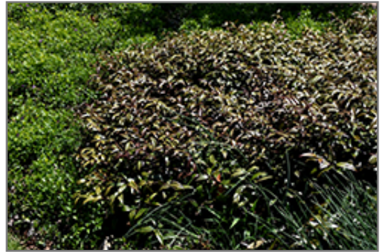
Scarletta Fetterbush

Thank you for choosing Seoane's Garden Center