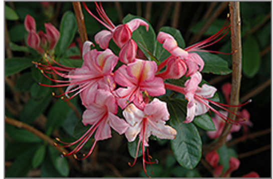
Pink And Sweet Azalea flowers

Pink And Sweet Azalea will grow to be about 4 feet tall at maturity, with a spread of 4 feet. It tends to be a little leggy, with a typical clearance of 1 foot from the ground. It grows at a slow rate, and under ideal conditions can be expected to live for 40 years or more.