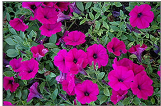
Wave Purple Classic Petunia flowers

Thank you for choosing Seoane's Garden Center